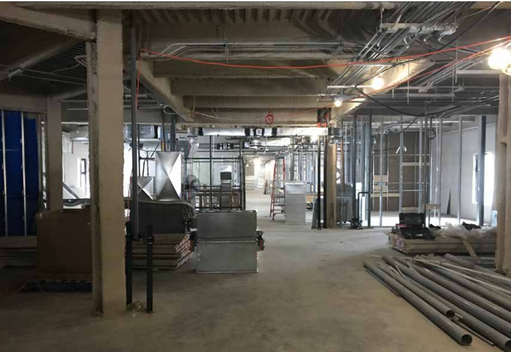
Corner Brook long-term care

Procurement has also begun on a new correctional facility to replace Her Majesty's Penitentiary and a new adult mental health and addictions facility.