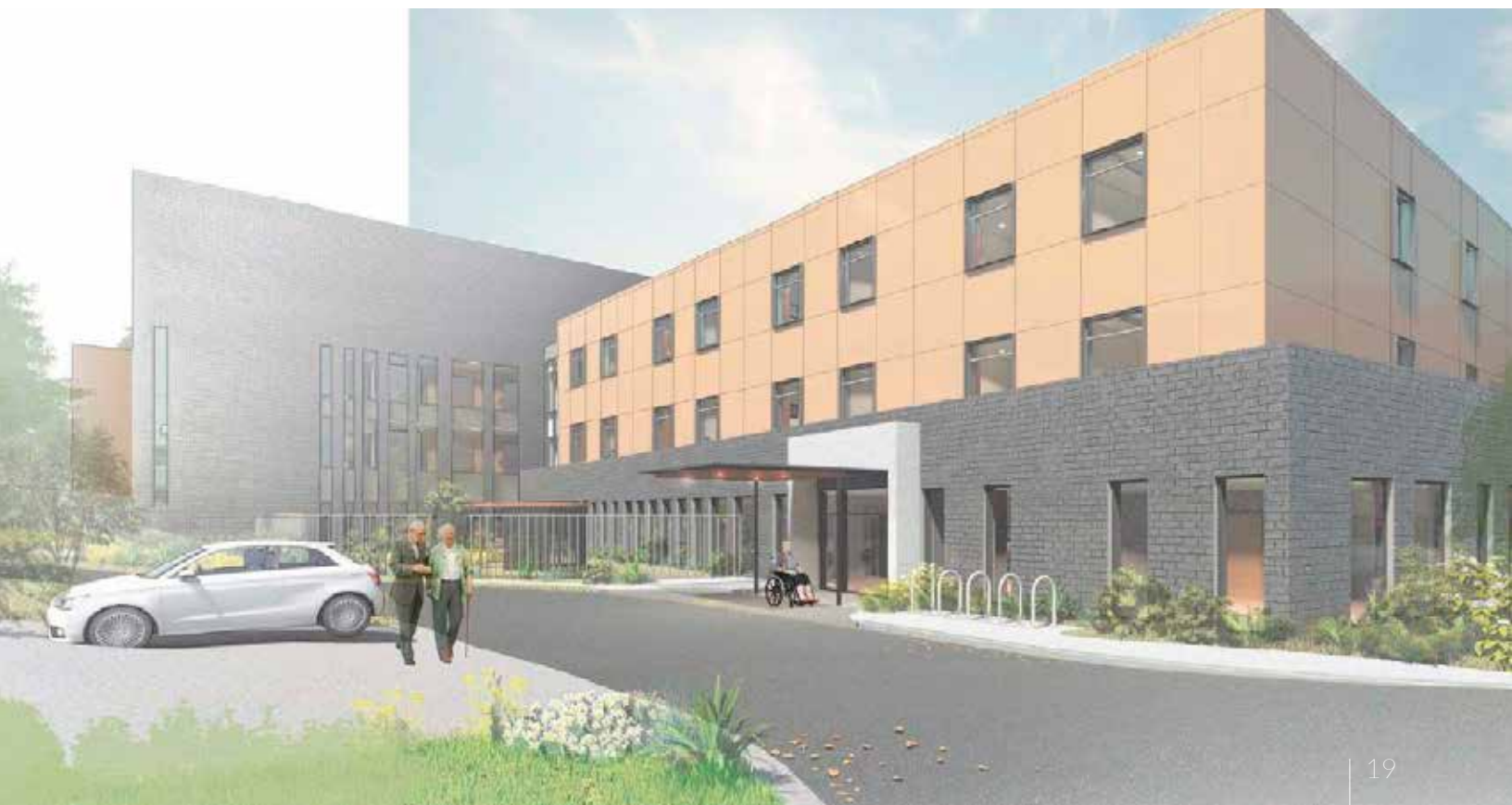
Gander Long-Term Care Home