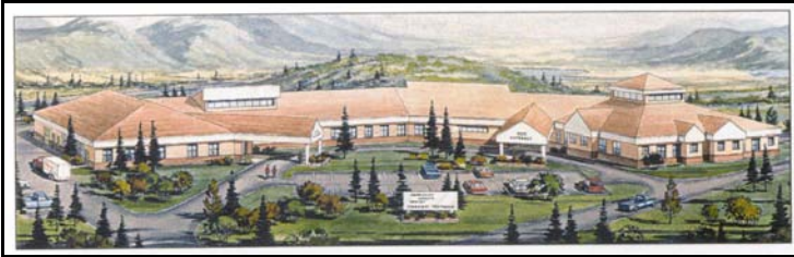
Connaigre Peninsula Community Health Care Facility

Healthcare - WST provides design and construction management on healthcare facilities for the province. During the reporting period, WST managed total expenditures of approximately $25.6 Million.