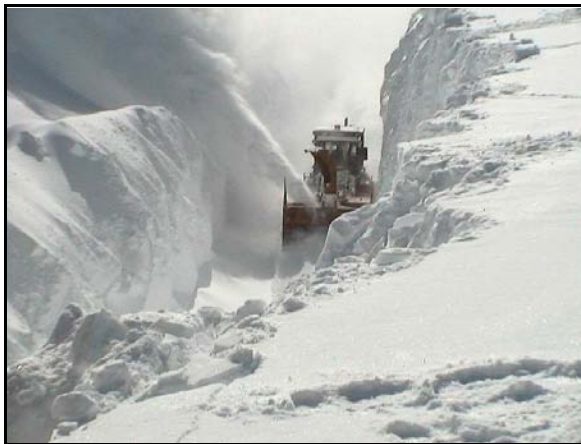
Winter Maintenance - TLH