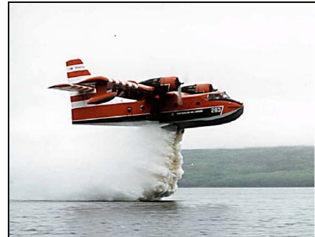
Bombardier CL215 Water Bomber

WST's water bombers are utilized for forestry protection and management programs. In the 2002-03 fire season, water bombers fought 140 fires, all of which were quickly contained. The six Air Tankers flew 105 missions and dropped 7,398,400 litres of water\foam. One water bomber spent five days out of province assisting the Province of Nova Scotia with its forest fire activities.